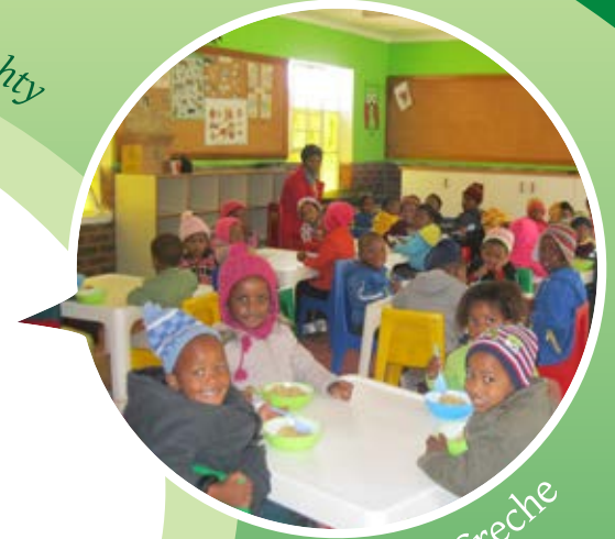
Schools & Creche