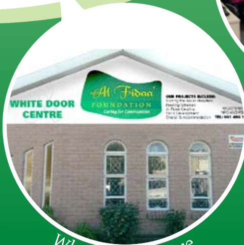
White Door Centre