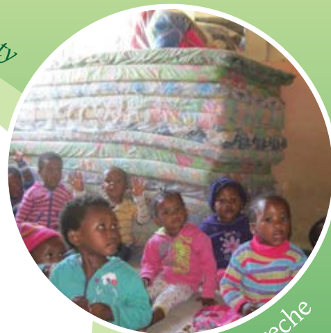
Schools & Creche

12 Market Street, North End, Port Elizabeth, 6001 P.O. Box 10389, Linton Grange, Port Elizabeth, 6015 Tel: +27 (0) 41 4841288 Fax: +27 (0) 41 484 1214 Email: alfidaa@telkomsa.net Web: www.alfidaa.co.za