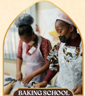
BAKING SCHOOL KWA-ZULU NATAL