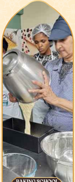
BAKING SCHOOL QOEBERHA