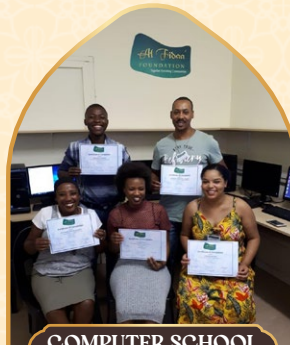
COMPUTER SCHOOL KWA-ZULU NATAL