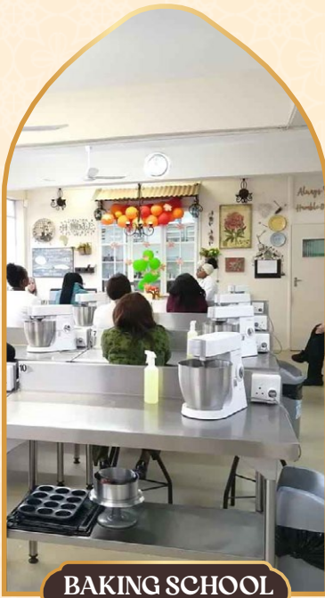
BAKING SCHOOL QOEBERHA

Al-Fidaa Foundation Skill Centres in South Africa