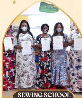
SEWING SCHOOL KWA-ZULU NATAL