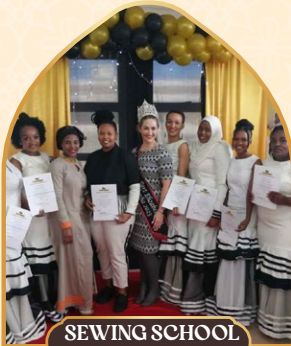
SEWING SCHOOL QOEBERHA