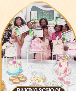
BAKING SCHOOL PIETERMARITZBURG