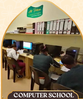
COMPUTER SCHOOL QOEBERHA